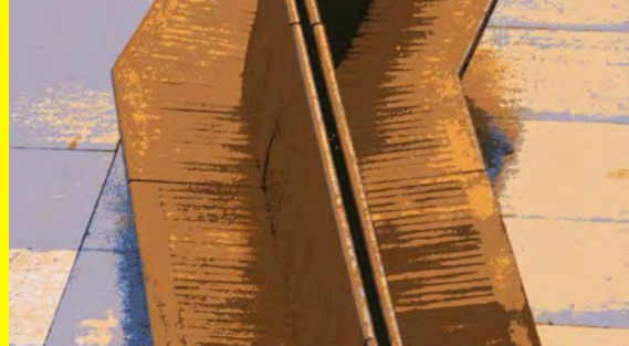
Benches & Bike Racks