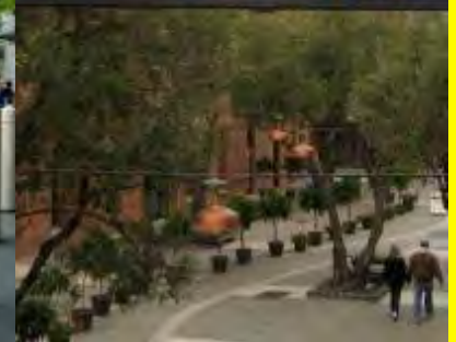
Gateways & Signs