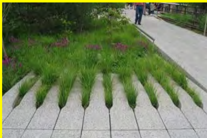
Linear Planting Beds